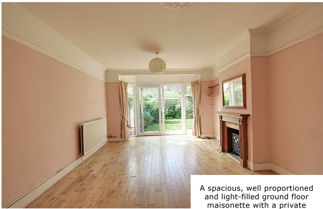
A spacious, well proportioned and light-filled ground floor maisonette with a private rear garden situated within easy walking distance of Kings Langley High Street.